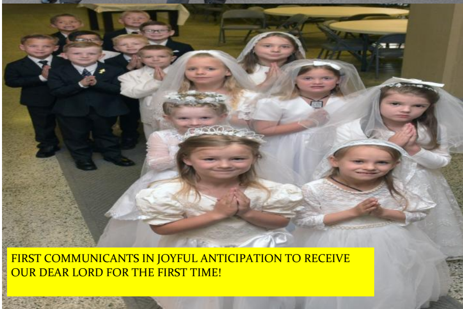
FIRST COMMUNICANTS IN JOYFUL ANTICIPATION TO RECEIVE OUR DEAR LORD FOR THE FIRST TIME!