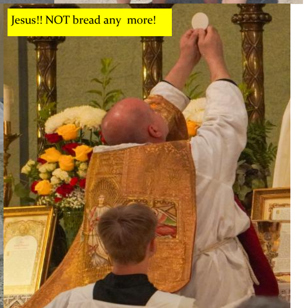
Jesus!! NOT bread any more!