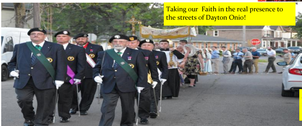
Taking our Faith in the real presence to the streets of Dayton Ohio!