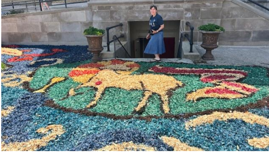
Creating something beautiful for God!