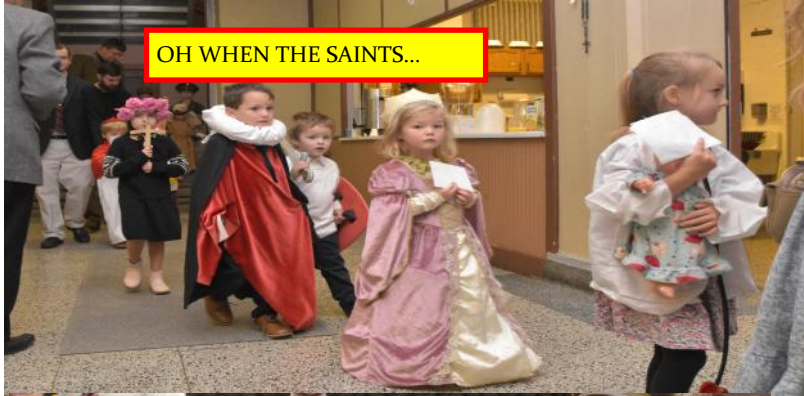
OH WHEN THE SAINTS...