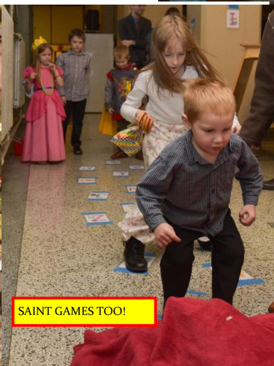
SAINT GAMES TOO!