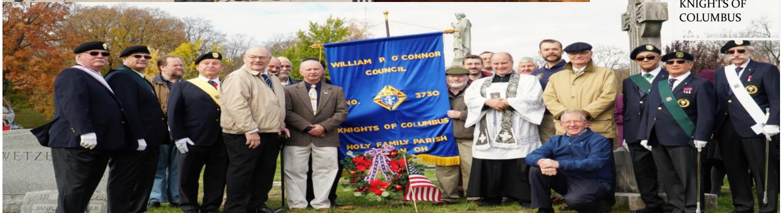
KNIGHTS OF COLUMBUS