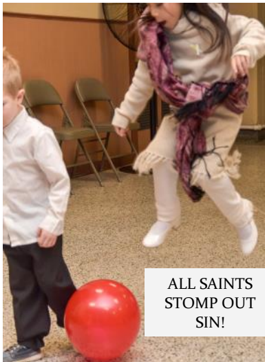
ALL SAINTS STOMP OUT SIN!