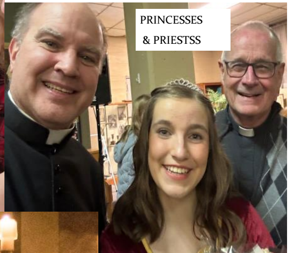
PRINCESSES & PRIESTSS