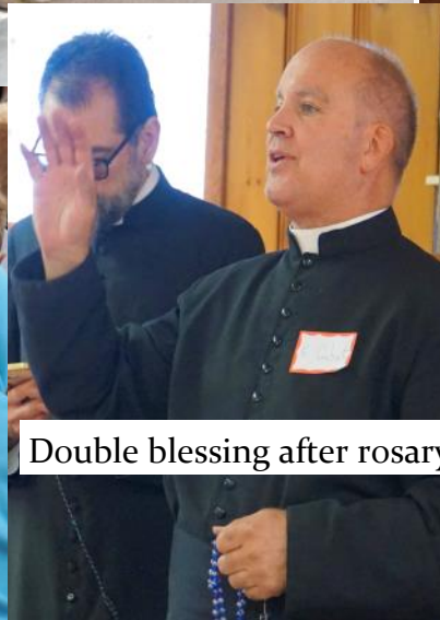
Double blessing after rosary