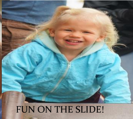
FUN ON THE SLIDE!