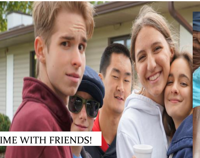
TIME WITH FRIENDS!

Fri 7PM Sat 2 & 7PM; Adults$10,Family$25 students $5 FRIDAY MASS WILL BE AT NOON. NO 7PM MASS THIS FRIDAY ONLY!