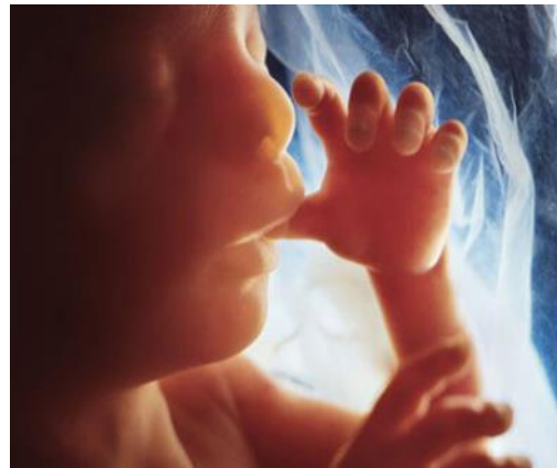
IMAGE AND LIKENESS OF GOD! BABIES ARE NOT A DISEASE OR A TUMOR BUT A BLESSING!! ABORTION IS NOT HEALTH CARE! IT IS SAYING A BABY MUST DIE SO

ABORTION KILLS A LIVING BABY MADE IN THE