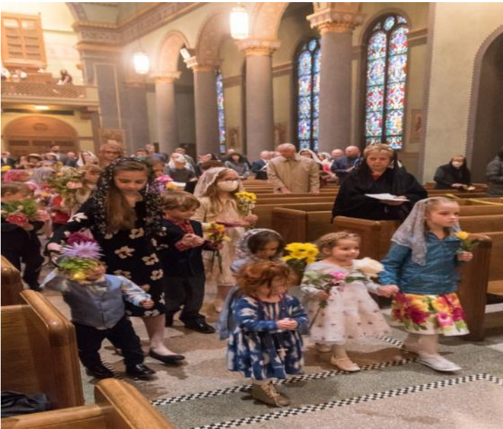
It was raining outside but the children's hearts were not dampened as they joined in the inside procession!

THE MONTH OF MAY IS DEDICATED TO MARY Let us recall that the whole month of May is dedicated to Our Blessed Mother. During this month when new life buds forth we are reminded of Mary's important role in salvation history budding forth the Savior of the world. We therefore set up May altars in church and in our homes to honor her as our Queen and our Mother. Traditionally we pray the rosary each day and we add the Litany of the Blessed Virgin Mary to show our great love and gratitude to her. We remember her promise: "In the end my Immaculate Heart will triumph!" Be a part of her victory! O MARY QUEEN OF THE MAY-PRAY FOR US