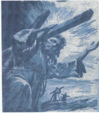
COME FOLLOW ME!

Holy Mother Church grants a Plenary Indulgence under the usual conditions (Confession, Communion, prayers for the Pope & detachment from all sin) for making the stations! Could there be any better way to spend 45 minutes?