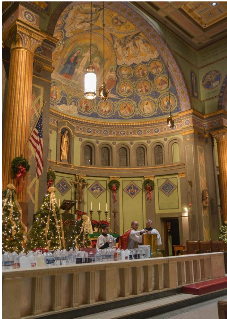
ABOVE- Epiphany Water Blessing Jan 5th

The Holy Water Vat at the communion rail near the Blessed Mother's altar contains Epiphany Water that was blessed with that very special blessing on the Vigil of the Epiphany. Please help yourself to this powerful sacramental of the Church! Some plastic Holy Water containers are available for you— ONE PER HOUSEHOLD PLEASE — compliments of Holy Family.