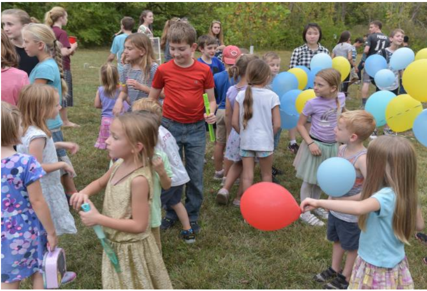
ABOVE- PARISH PICNIC A lot of young people at the parish picnic is a sign of a parish with a future!