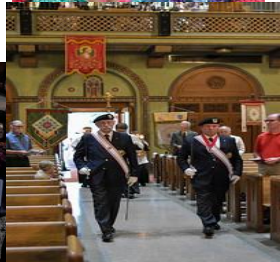
Final Photos of Corpus Christi clockwise from above. The beautiful art! The procession with our Lord—taking our faith to the neighborhood. Two of the First communicants happily helped with the decorations before donning their gowns for the Mass later that night. The K of C Honor Guard and 2 helpers cleaning up in record time!