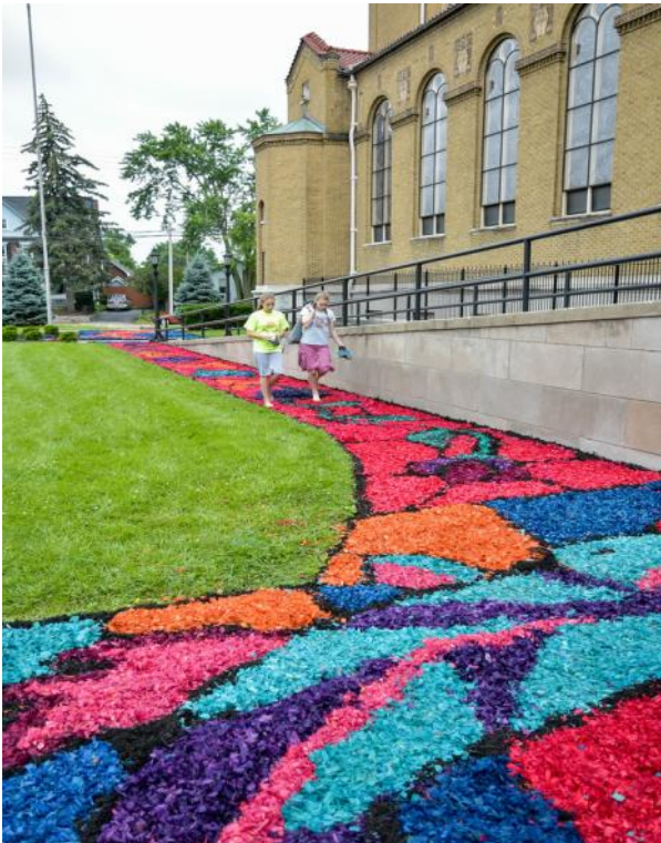
MORE CORPUS CHRISTI PHOTOS!

Visit the Legion of Mary booth and enjoy the many events! July 8—14th, 645 Infirmary Road, Dayton!