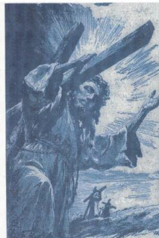
"COME FOLLOW ME"