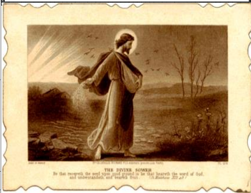
THE DIVINE SOWER He that sows the seed upon good ground is he that hearth the word of God, and understandeth, and beareth fruit. — Matthew 13:23

Please contact the rectory at least six months in advance